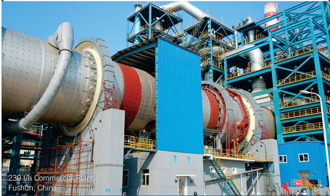
230 t/h Commercial Plant Fushun, China

The most advanced retort. Capacities up to 500 t/h.